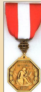
National Defense Service Medal