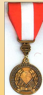
Armed Forces Expeditionary Medal