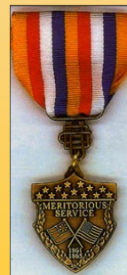
Meritorious Service Award