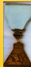
Pioneer in Space Award